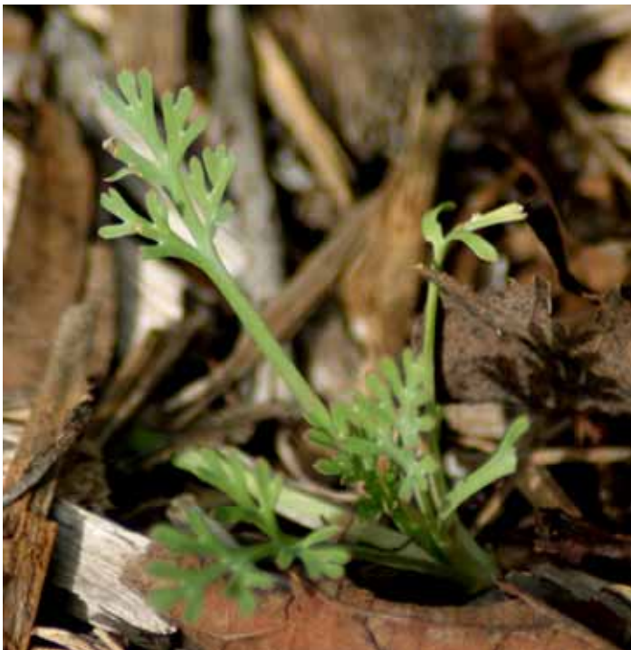
California poppy seedling