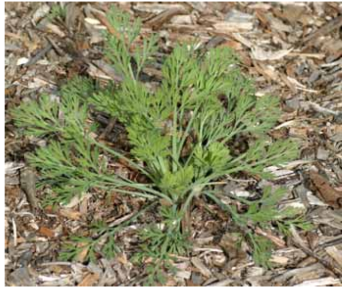
California poppy seedling